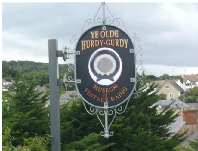
The sign outside the radio museum in Dublin

Can be found on the below link according to Kurt Pedersen. 3.527537,172.633199&spn=0.011435,0.01914&ie=UTF8&ll=-41.277742,174.777203&spn=0.005926,0.00957&z=14&layer=c&cbll=-41.284938,174.773969&panoid=Fk9BoBO-CvJqDYbR6l0BpQ&cbp=12,149.85831707301656,0,-1.9843104057744934&source=http://maps.google.co.nz/maps?f=q&hl=en&geocode=&q=the+terrace+wellington&sll=-4e=embed